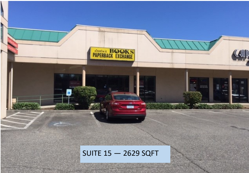
SUITE 15 — 2629 SQFT

JOIN SMILE4KIDS, CAPELLI SALON & SPA, THAI HOUSE, PHO VY, TAQUERIA URUAPANI AND OTHERS AT SOUTH SOUND PAVILION