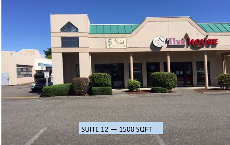
SUITE 12 — 1500 SQFT

FREESTANDING BUILDING OF 1356 SQFT located on the hard corner available as is or possible development opportunity. Previous florist shop. Needs work-$18.00